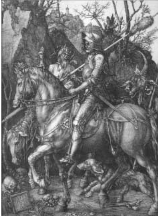
June ASXXXVI (2001 A.D.)